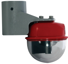
Sectored Bridge Light