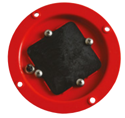
SL-15 with optional ON/OFF switch